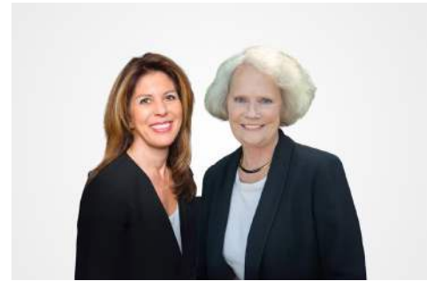
The Gina Team Auburn • 5