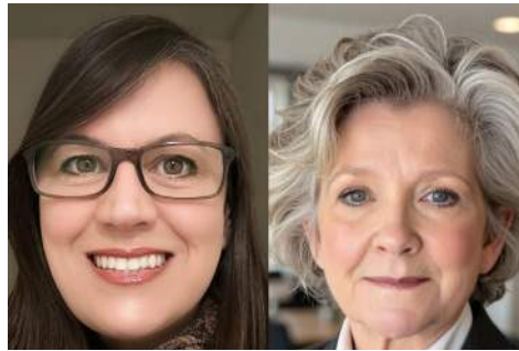
Horizons Group Machias • 5