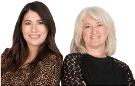
Bartlett Team Bangor • 5