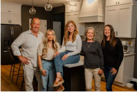
Moore Trew Team Bangor • 13