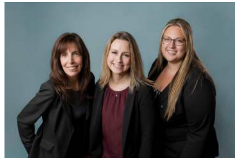
The Legacy Team Augusta • 4