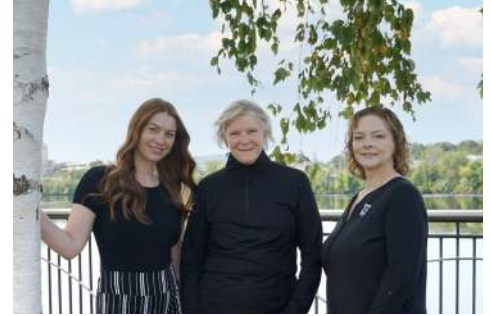
Osler/Bilancia Team Bangor • 7