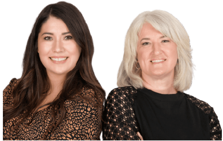
Bartlett Team Bangor • 4