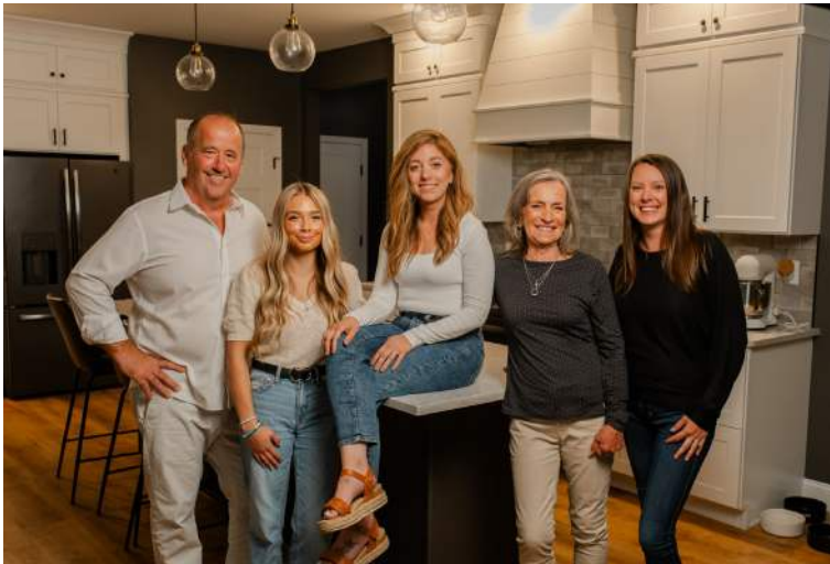
Moore Trew Team Bangor • 3