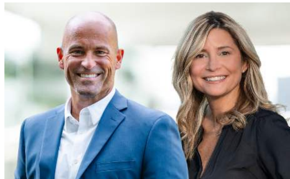
Renee's Realty Network Auburn • 3