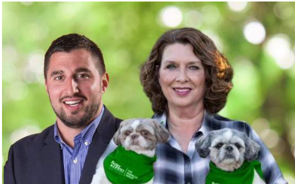
Team Dube Auburn • 4