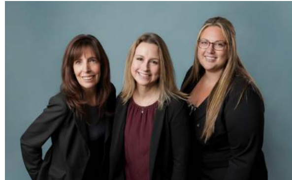
The Legacy Team Augusta • 4