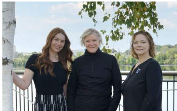
Osler/Bilancia Team Bangor • 3