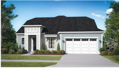
First Floor Selected Options: