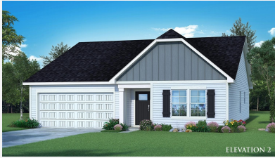
First Floor Selected Options: