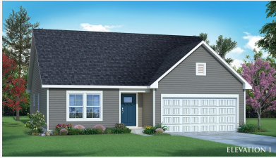
First Floor Selected Options: