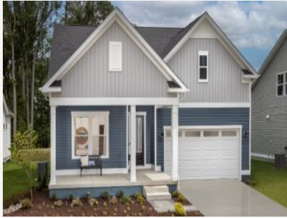
First Floor Selected Options:

Latitude The Granary at Draper Farm: 302-485-0202