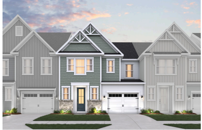
Elevation Arts & Crafts