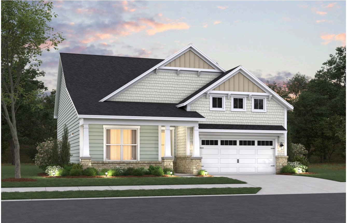
Elevation Arts & Crafts