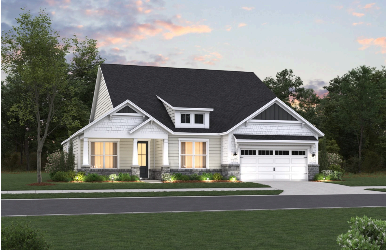
Elevation Arts & Crafts