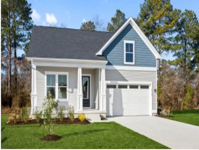
First Floor Selected Options:

Aloha Cypress Creek Estates: 302-485-0202