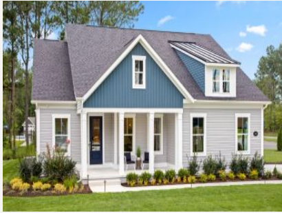
First Floor Selected Options:

St. Kitts Cypress Creek Estates: 302-485-0202