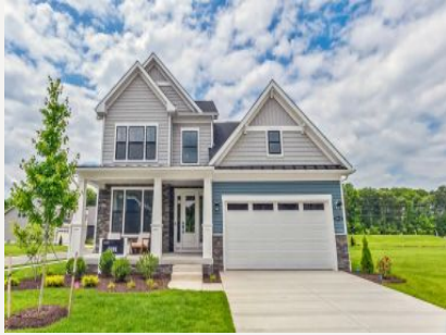
First Floor Selected Options:

Dune Cypress Creek Estates: 302-485-0202