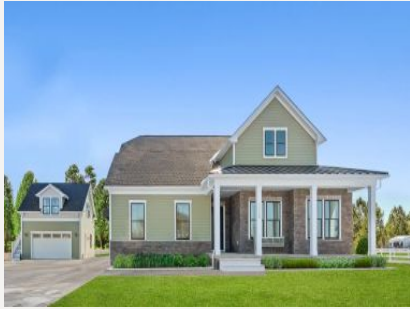
First Floor Selected Options:

Antigua Cypress Creek Estates: 302-485-0202