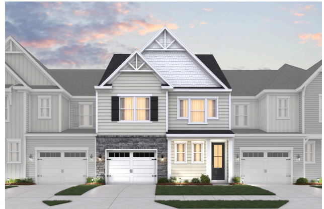
Elevation Arts & Crafts