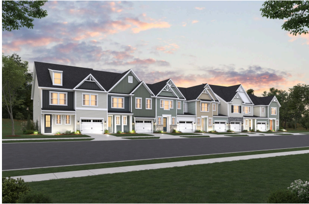
Elevation TH Heron