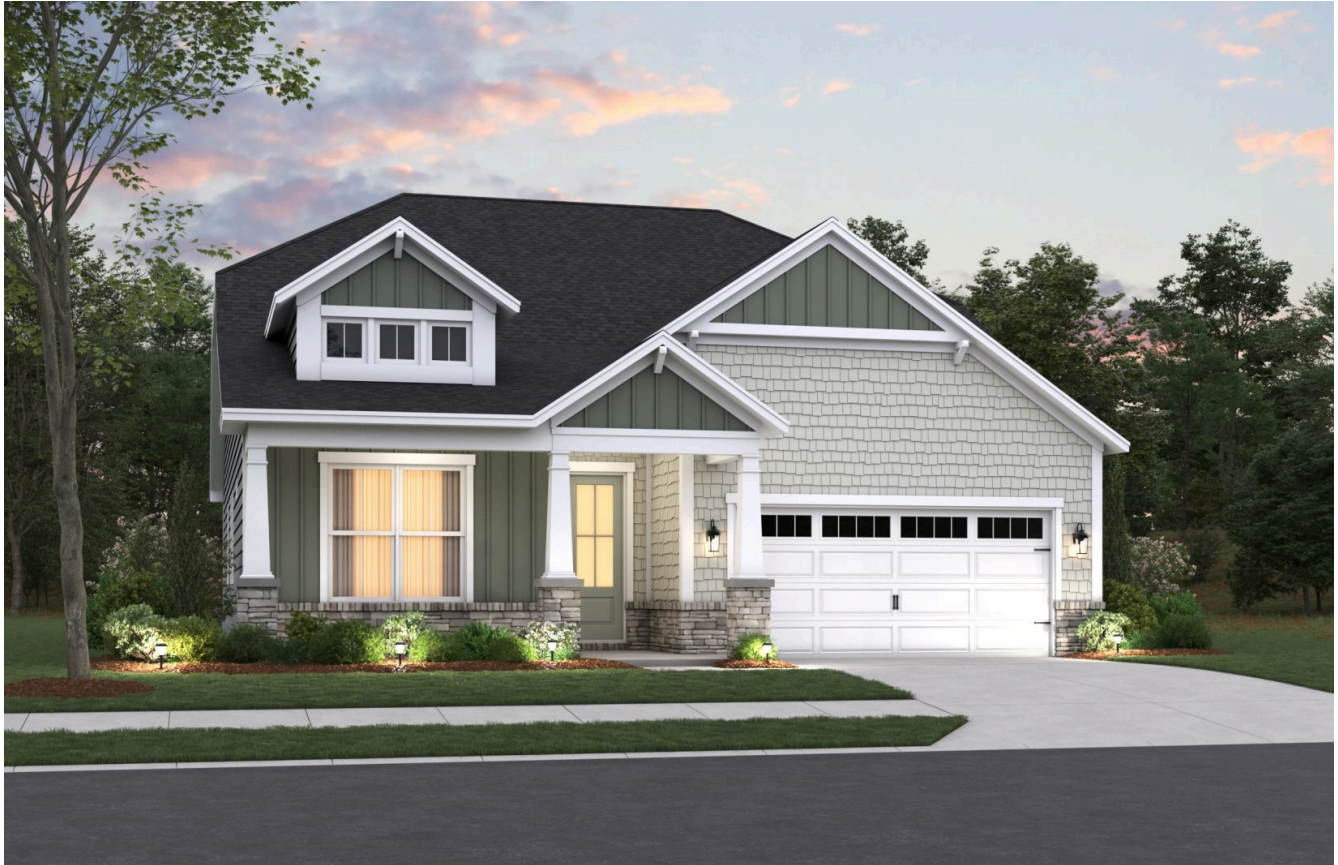
Elevation Arts & Crafts