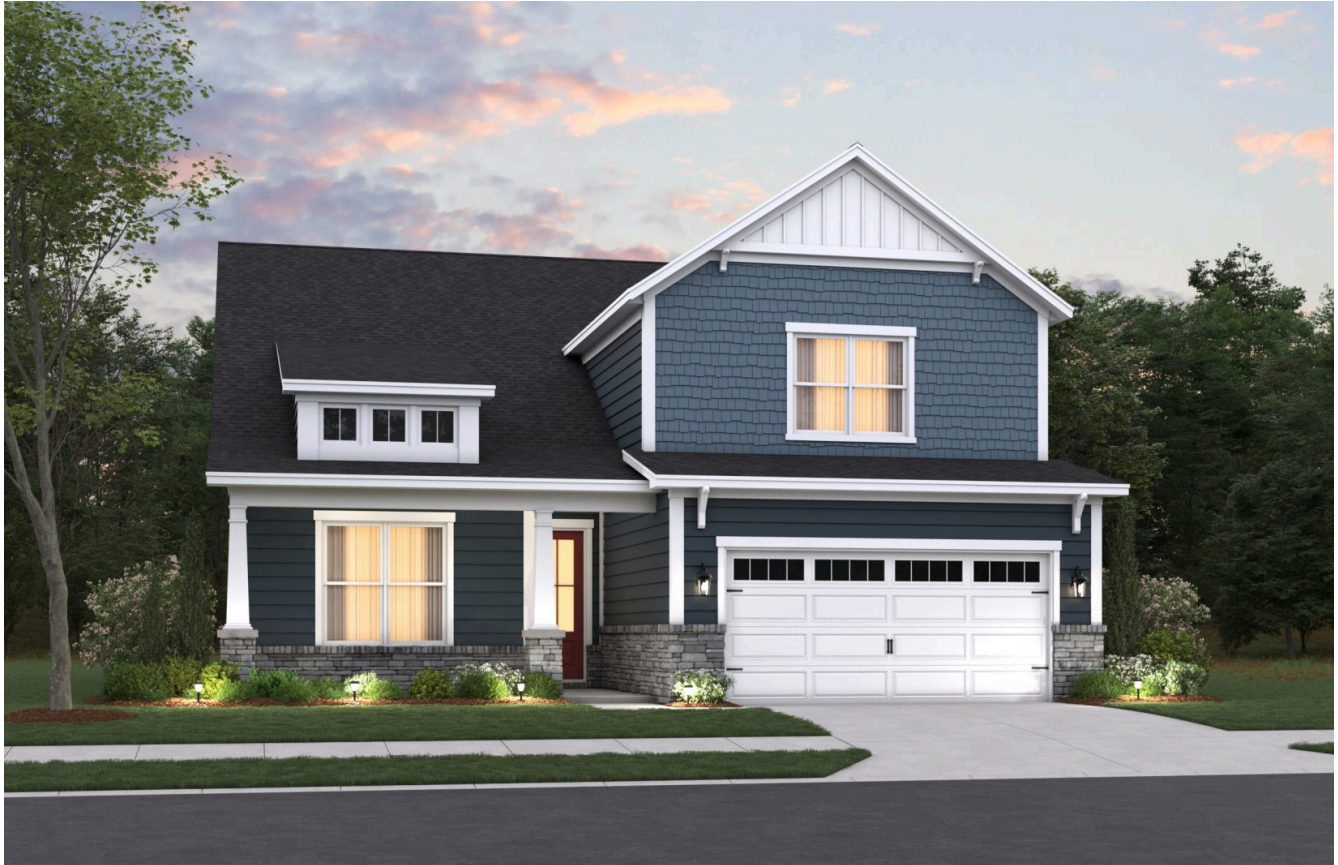
Elevation Arts & Crafts