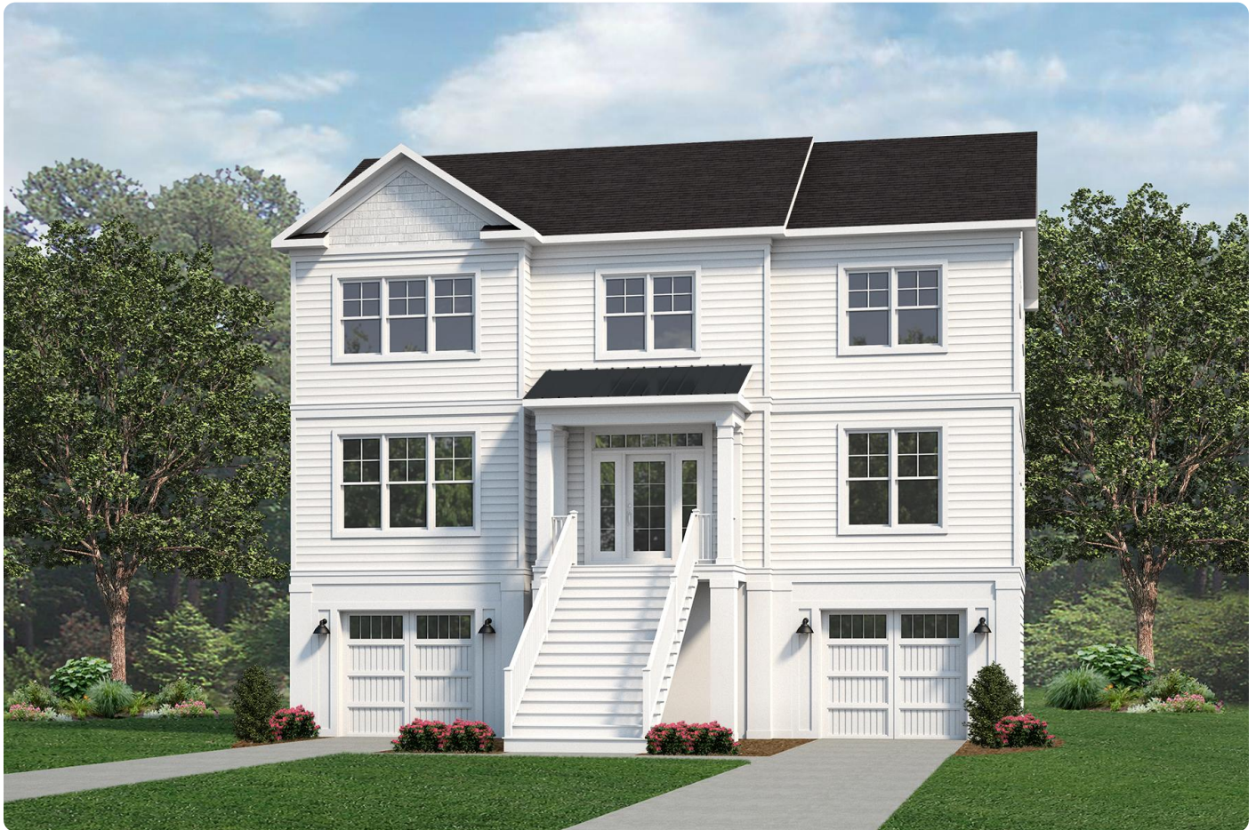
Campbell 3.0 A DE and MD Beaches Bethany Beach, DE