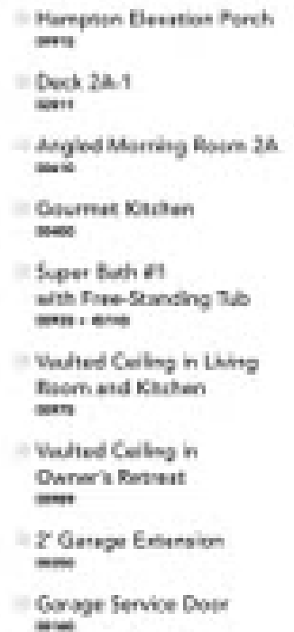
First Floor Plan With Popular Options (Hampton Elevation Shown)